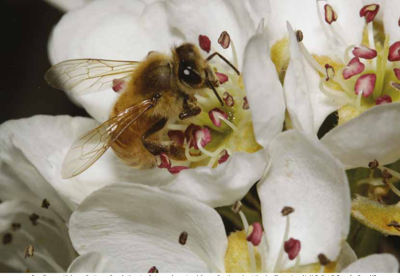
Pear flower with bee collecting pollen. Anthers in all stages of opening deliver pollen throughout the day. Photo: Jean-Noël Galliot © Trees for Bees NZ. Pear flower with bee taking nectar. The bee 'tongue' (proboscis) is extended into the centre of the flower for sipping nectar. Photo: Jean-Noël Galliot © Trees for Bees NZ.